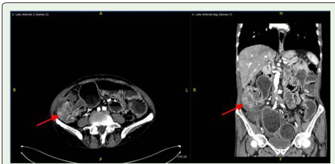
Figure 1: Abdominal computed tomography scan revealing a mass in the cecum and proximal ascending colon.

9.5x5.5 cm. A small sized, grayish red, pedunculated polyp measuring 1.5x1.5x1 cm is detected 5cm from the distal resection margin. Through dissection of pericolonic fat revealed seventeen small sized lymph node and multiple. Microscopically, revealed adenocarcinoma with strips of tumor cells floating in large extracellular mucin lakes comprising more than half of tumor mass. Signet ring cells (with intracellular mucin) are also present, comprising less than half of tumor. The sigmoid polyp was pedunculated with stalk and it measuring grossly as 1.5x1.5x1 cm with 0.5cm stalk length. Its histopathological report came as tubulovillous adenoma with low grade dysplasia / No malignancy. Gross findings of the right renal mass, its single, large-sized, oval mass with smooth nodular outer surface measuring 4.5x 3.5x2.5cm. Cut section shows homogenous yellowish white solid area among foci of hemorrhagic cysticification and necrosis. Microscopic description of renal mass came as infiltration by well-formed malignant acini is seen along with signet ring cells, extracellular mucin lakes, area of hemorrhage and necrosis. No evidence or renal cell carcinoma is identified. The immunohistochemistry results show: CDX2 strongly positive, CEA strongly positive, CK20 positive, CK-34-b-E12positive, CK7 negative which represent metastatic mucinous adenocarcinoma from colon.