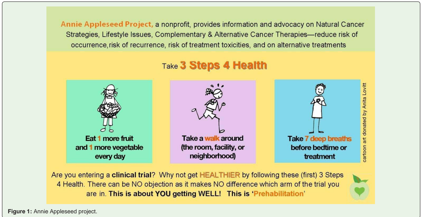
Figure 1: Annie Appleseed project.

(Figure 1) Eat one more fruit and one more vegetable every day. This is helpful since studies show few Americans are getting enough fruits or vegetables. The National Cancer Institute considers 'Five a Day', a minimum. We want to get people started on the correct path simply and easily.