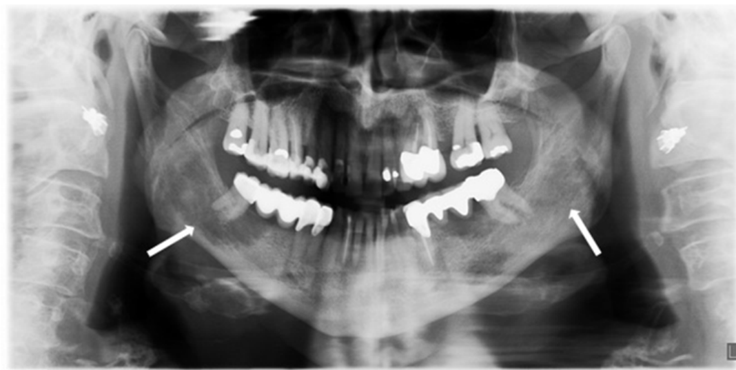
Figure 1: Panoramic X-ray. The arrows on the panoramic X-ray show osteolytic zones on the right and left angle of the lower jaw.

the mandible on both sides, right more than left (Figure 1). The patient was then referred to the clinic of cranio-maxillo-facial surgery for further evaluation. She reported pain in the area of the right angle of the mandible for several months; additionally, pain in the right calcaneus and in both forearms has been noted. She denied fever and weight loss, but reported cough and dyspnoea on exertion. Furthermore, a sicca-symptomatic in both eyes and the oral cavity was present. The patient was diagnosed with hypertensive cardiac disease, rhythmogenic cardiopathy, hyperlipidaemia, cutaneous psoriasis with psoriasis arthritis, and lumbar vertebral syndrome several years before. Her home medication included pantoprazol, candesartane, acetylsalicylate, spironolactone, and simvastatine.