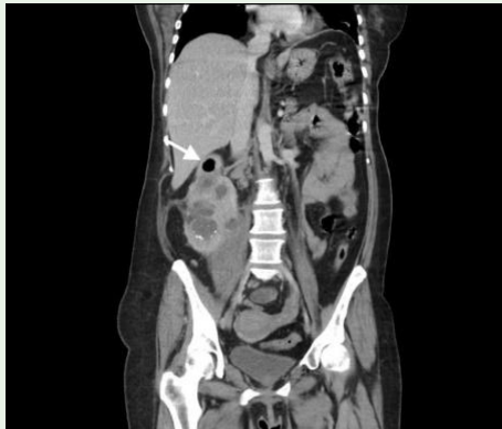
Figure 2: A coronal view of abdominal computed tomography shows an enlarged right-kidney and peri-renal gas (arrow).