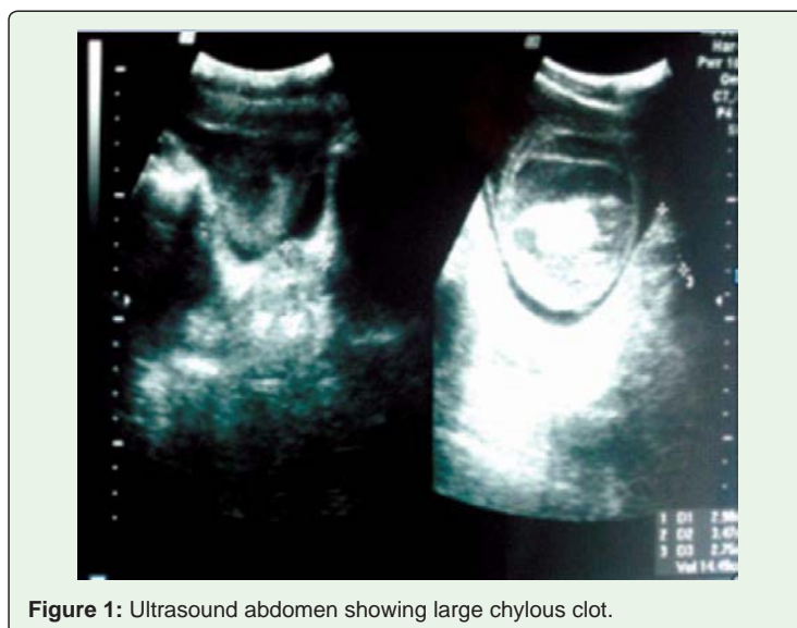
Figure 1: Ultrasound abdomen showing large chylous clot.

A 22-year old male, a known case of recurrent chyluria, presented with acute urinary retention. Abdominal ultrasound revealed a large clot in urinary bladder with normal upper tracts (Figure 1). Emergent cystoscopic examination revealed a large and tenacious chylous clot in the bladder (Figure 2) and efflux of chyle from the left ureteric orifice with clear-urinary efflux from the right side. Clot removal was attempted with Ellik evacuator, Toomey syringe and mechanical suction using suction bridge. However, these procedures failed to remove clots due to the elasticity and large size of clot. Morcellation and suction (Versa Cuttissue morcellator, Lumenis) was performed with morcellator used for morcellating prostatic adenoma tissue in holmium laser enucleation of prostate (HoLeP) procedure to evacuate the clot (Figure 3). 160 ml clots were removed in 18 minutes. The integrity of the urinary bladder was ensured. Post procedure, bladder irrigation through 22-Fr Foley catheter (triway) was initiated and post-operative period was uneventful. Foley catheter was removed after 48hrs. Later the patient was managed with sclerotherapy using 0.2% Povidine iodine on the left side [2].