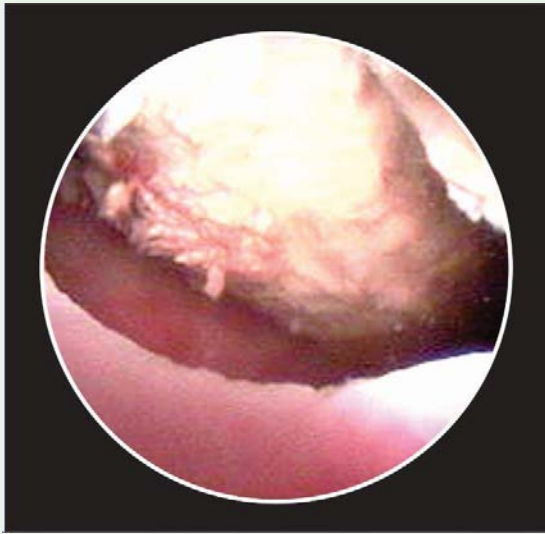
Figure 2: Cystoscopic view of large chylous clot.