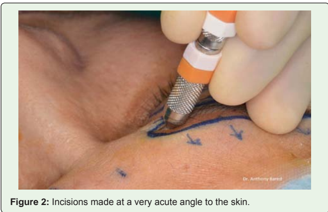
Figure 2: Incisions made at a very acute angle to the skin.

Once all incision sites are made, the grafts are then inserted. A typical procedure can range from 150 to as many as 400 grafts per eyebrow, depending on a variety of factors. The grafts are placed so that